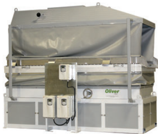
Oliver FBD 410 Dryer

* Temperature and humidity can cause capacity variation