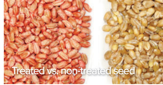
Treated vs. non-treated seed