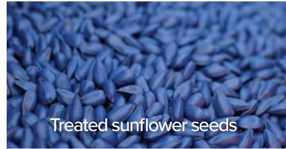
Treated sunflower seeds