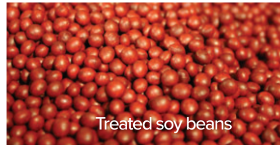
Treated soy beans