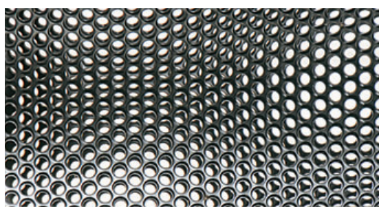
Round conical cylinder