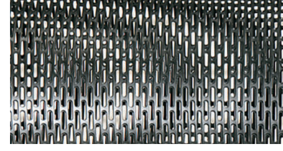
Slotted conical cylinder

Options include: vibratory conveyor, manual or pneumatic roller cleanout system, stainless steel contact points, stackable modular design options for multiple size grading, and custom door options.