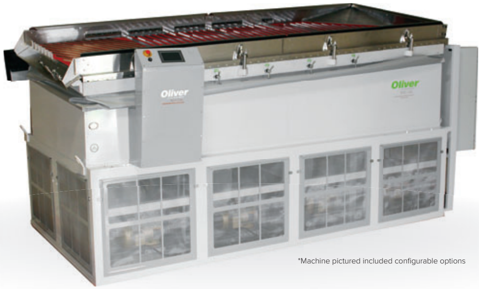
*Machine pictured included configurable options