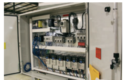
Built with the power to perform

What else can your Oliver do? Find out at olivermanufacturing.com .